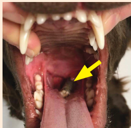
This is a typical stick injury where the stick has become lodged in the dog's throat – see yellow arrow.

Finally – we hope you enjoy the spring with your pets. Signs of poisoning can often be quite vague so please contact us at once if you are at all worried.