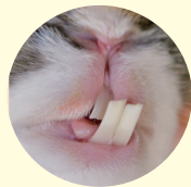
Misaligned and overgrown incisor (front) teeth

Vaccination: Rabbits can be vaccinated against Myxomatosis and Viral Haemorrhagic Disease. Both of these can be rapidly fatal. There are vaccines available that give good protection and are recommended for yearly use. Since myxomatosis can be spread by flies and mosquitoes, it is recommended to have indoor rabbits vaccinated as well. If you would like further information on caring for your rabbit, feeding, dental health and vaccination, please don't hesitate to contact our helpful team.