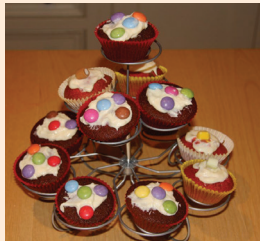
Beware of cakes (including many home made cakes) made with the artificial sweetener xylitol, which is extremely toxic to dogs.