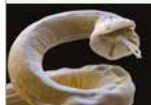
Electron micrograph of an adult lungworm

soil or whilst playing with toys in the garden. Lungworm larvae can even be found in the trail that snails leave behind in your garden. The disease is commonest in young dogs that eat or play with slugs and snails, and in dogs that eat or drink outside and may have had slugs or snails in their bowls.